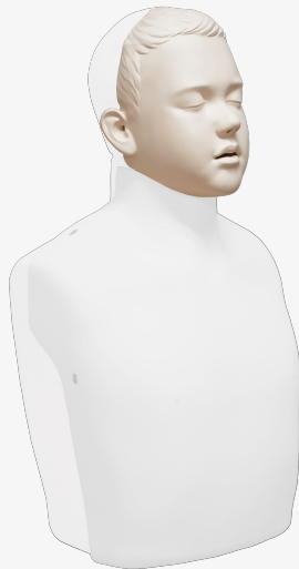
Face skin (1 ea) - Including a mouth connector