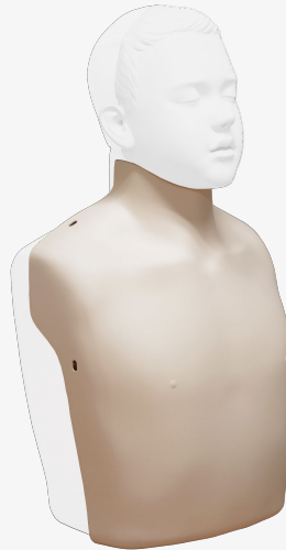
Body skin (1 ea)